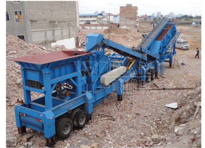
HCP (A)/HCS (A) Series Impact Crusher